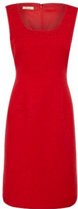
Precis Poppy red lace shift dress Was £129 now £59.99