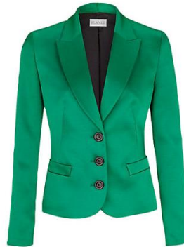
Planet Tailored Jacket Emerald Green Was £169 now £59