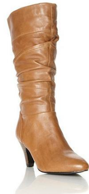
Dune Tan rye Slouch Calf Boot £12.00